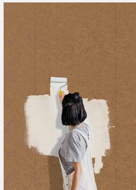
9 x 620 x 2400 mm JUST PAINT PANEL

VITO JUST PAINT IS A HDF PANEL - READY FOR PAINTING